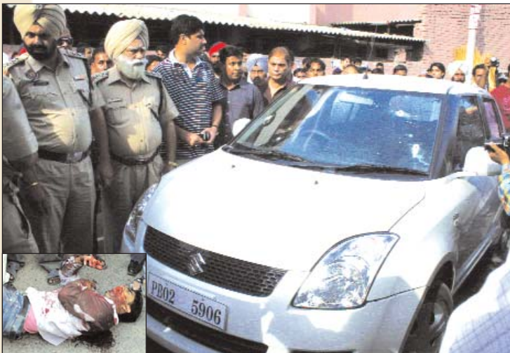
Police officers with stolen car and injured robber (inset)